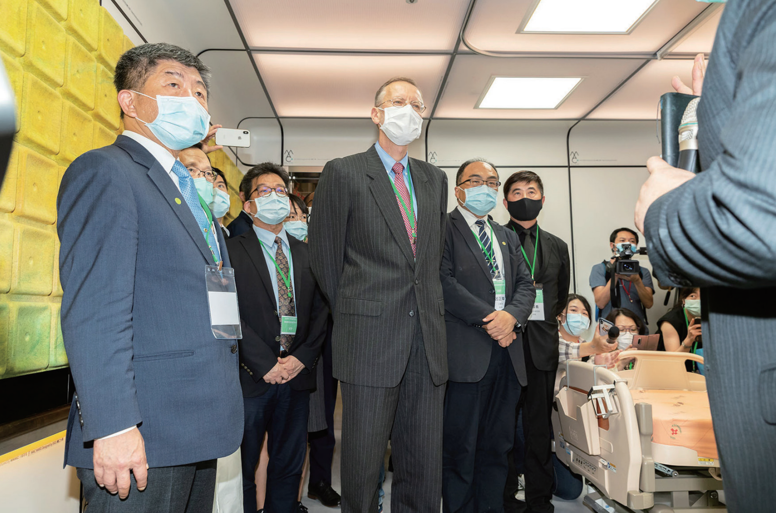
▲ Health Minister Chen Shih-chung and AIT Director W. Brent Christensen tours FJCU Hospital's MAC ward.

AIT Director W. Brent Christensen stated “today’s announcement demonstrates again that Taiwan is a reliable partner and a force for good, sharing both its expertise and its resources with governments, universities, and public health institutions in the United States and all around the world. Taiwan is an international leader in public health, and the “Taiwan Model” for managing the spread of COVID-19 has been recognized around the world.”