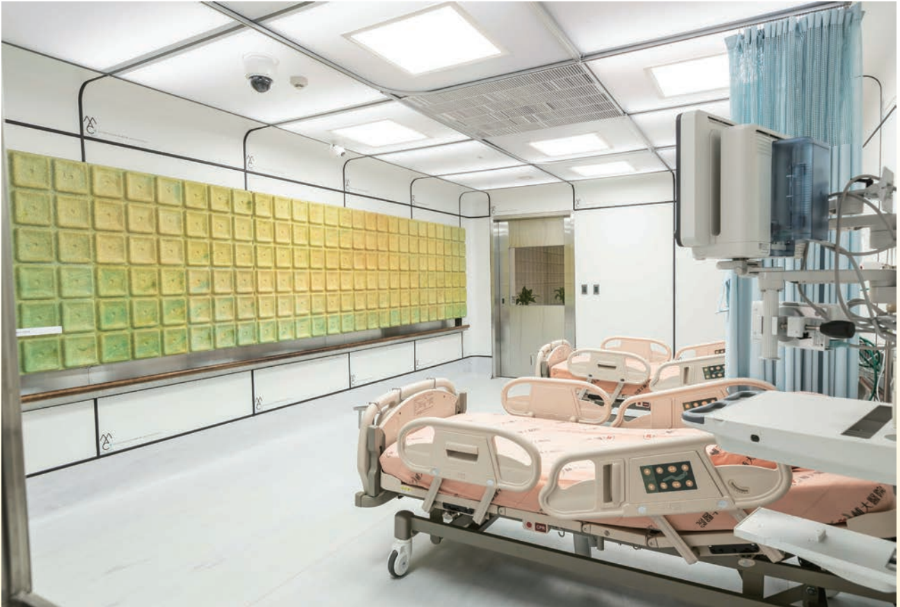
▲ The MAC ward offers a comfortable interior, on top of catering for remote medical care.