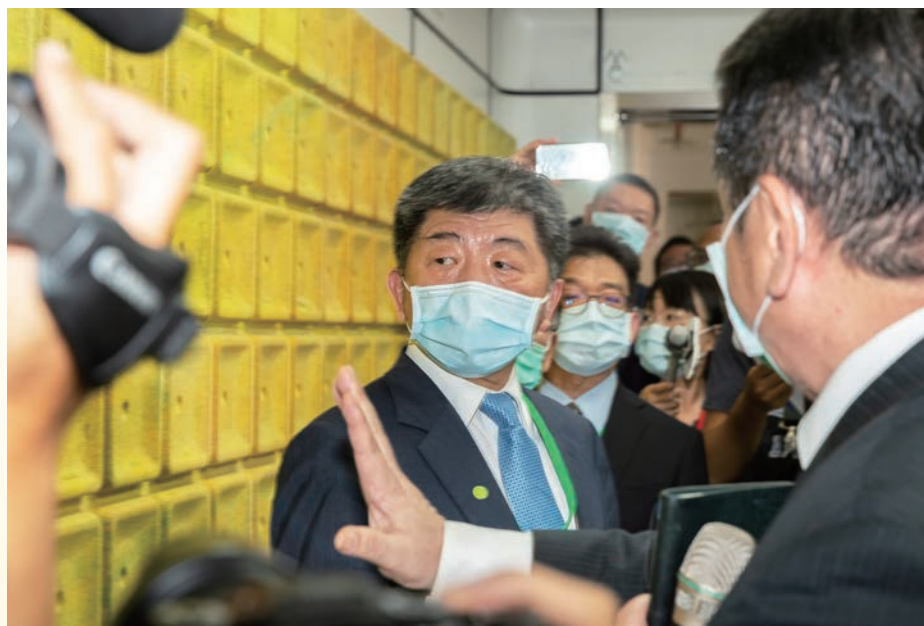
▲ Health Minister Chen Shih-chung tours FJCU Hospital’s MAC ward.

Minister Chen stated after a tour of the MAC ward that “this is the eighth consecutive day whereby there are no new cases of Covid-19 in Taiwan – evidence that Taiwan is safe. The shortage of manpower is an issue keenly felt by all of us during the pandemic, but it is in times of crisis that humanity displays its ability to achieve breakthroughs. Taiwan’s advantage is in its innovativeness and flexibility, and we have had more opportunities for collaboration with the U.S. as a result of this, helping us make more friends and sharing our results with the world, so as to let the world take notice of Taiwan, and of FJCU.”