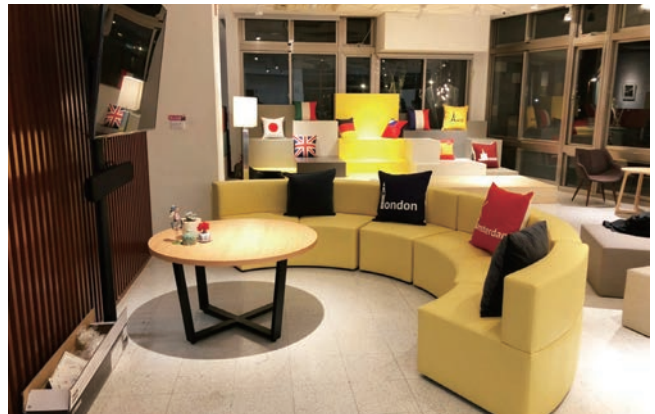
▲ Picture: The design of Global Lounge appeals to the youth.