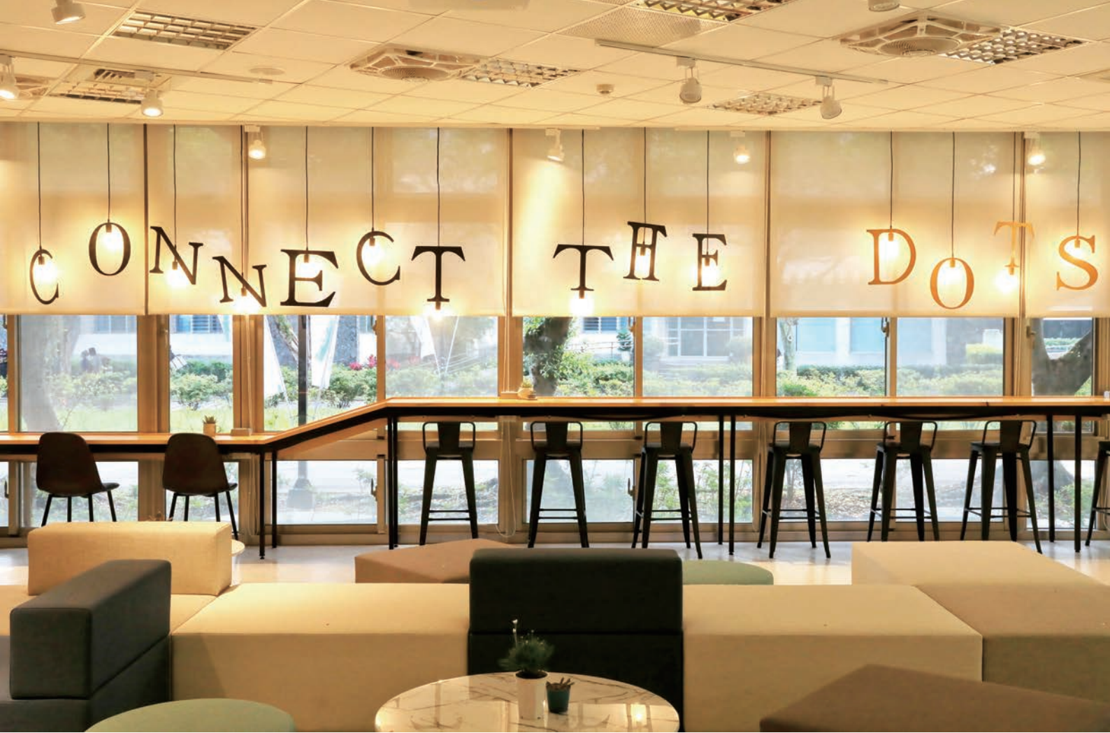
▲ Picture: Take a seat by the windows, and enjoy the campus greenery from the bar table.