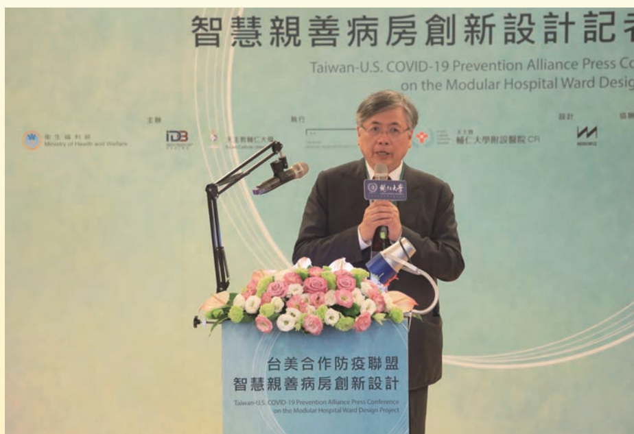
▲ FJCU President Chiang opines that high-tech medical wards are the trend.

A doctor himself, FJCU president Vincent Chiang Han-sun opined that the high-tech ward facility “is the trend. The MAC ward boasts quick assembly as well as remote medical care capability, with individualized air-conditioning and disinfection. It can also be transformed into various types of medical wards (ICUs, general wards, or isolation wards), and is interchangeable depending on the specific medical needs. It can be used during the pandemic or during regular times, ensuring its practicality in the long run. This a successful model of a pioneering medical ward for disease prevention.”