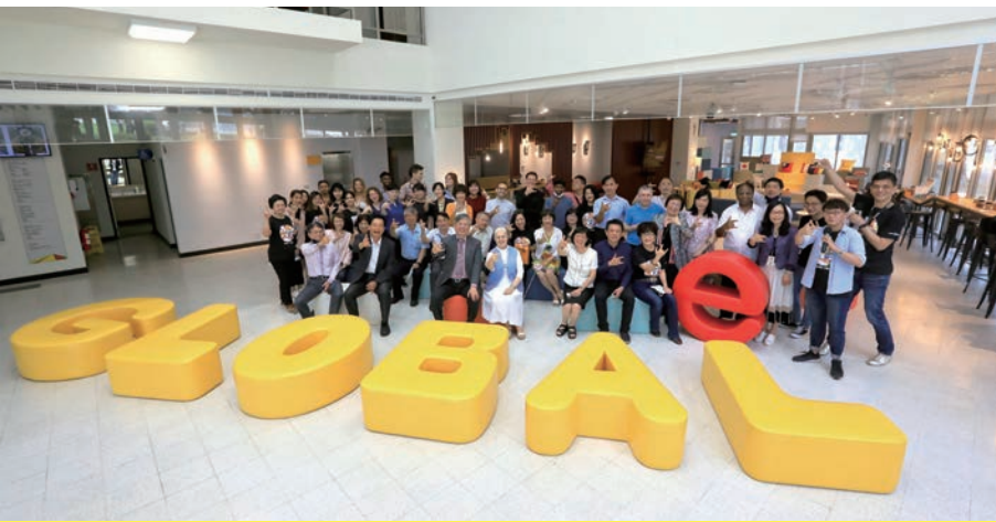
▲ Picture: Teachers and students take a commemorative picture in front of the Globale sofa.